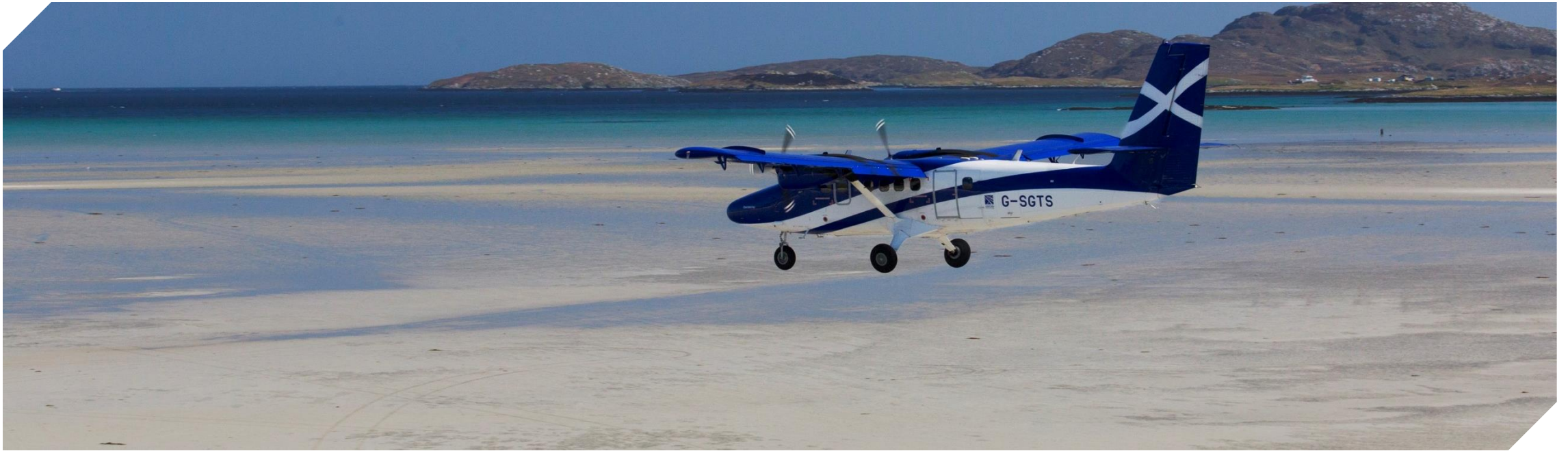
Twin Otter Landing on the beach at Traigh Mhor.