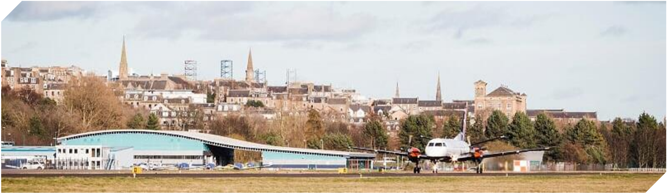
A Loganair flight preparing for take-off.