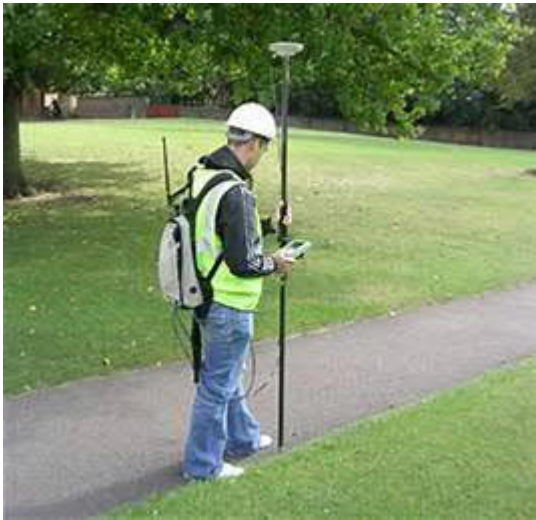
Hand Held GPS Receiver