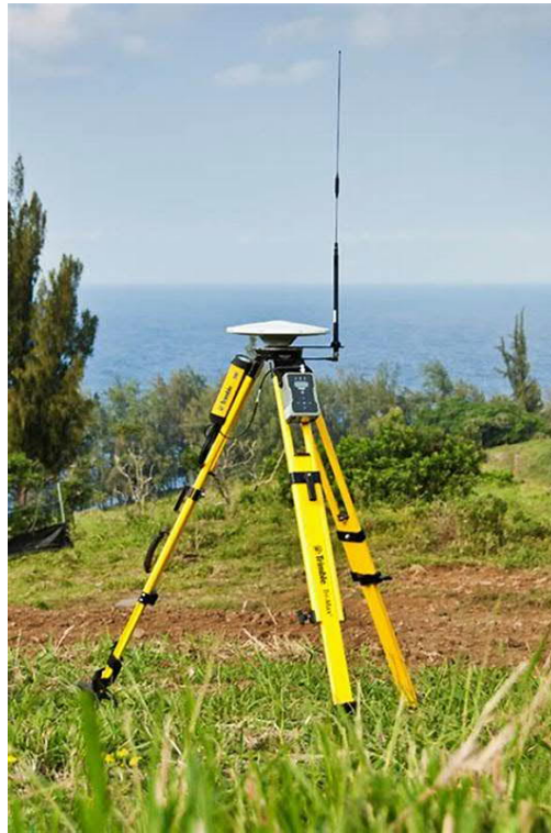
GPS Base Station