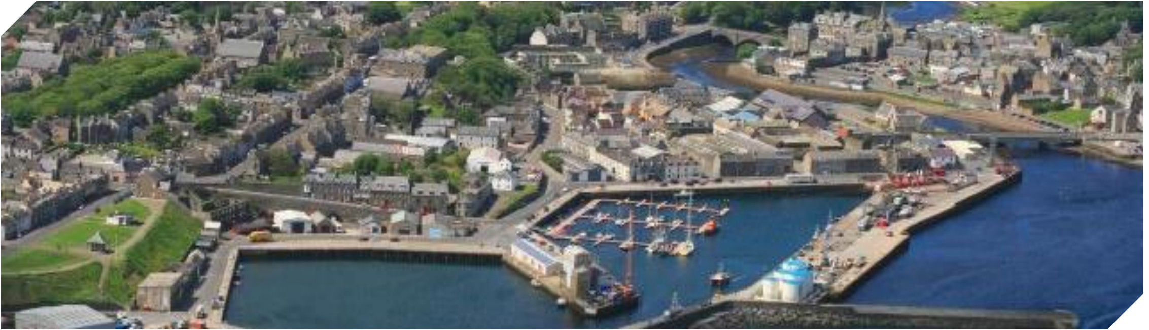
Wick Marina.